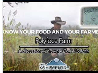
Polyface Farm Interview