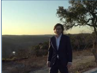
Surrey Hill Austin Real Estate

These are videos I have filmed, edited & produced.